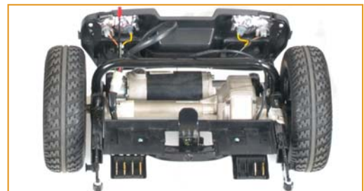
Quiet & maintenance free motor