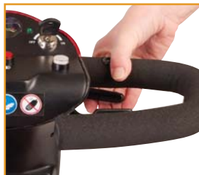
EZ Reach tiller adjustment