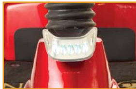
Angle adjustable LED headlight creates a wide path of bright light