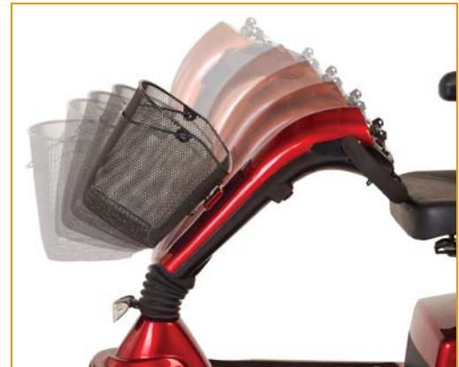
Patented infinite adjustable tiller